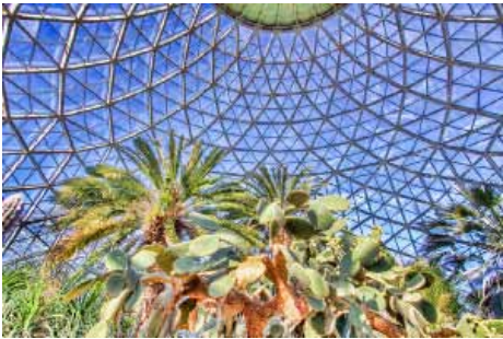
Cactus and Blue Sky Diane Hamernik