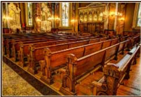
Right Side View Bill Pehrson