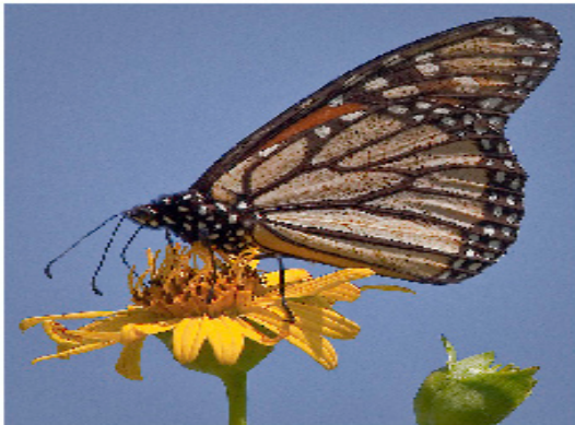
Butterfly Lunch